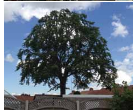
Above shows a before and after shot of a Beech Tree recently worked on by the Blackberry Tree Surgery team

For more information please contact us - Visit: www.blackberrygardens.co.uk Call: 0117 904 8780 or e-mail blackberrygardens@yahoo.co.uk